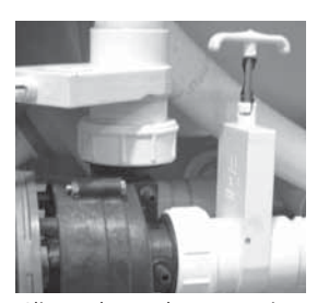
Slice Valve and Pump Union

*NOTE: Slice valves must be completely open during normal operation.