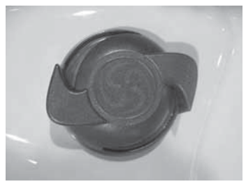
Air Control Valve

These are located around the top of your swim spa. You may increase or decrease the force of your jets by opening or closing the air control valves. Typically, one dial controls the air to water ratio and mix to one group of jets. When not in use the air controls should be kept in the closed position, as air bubbles tend to cool the water.